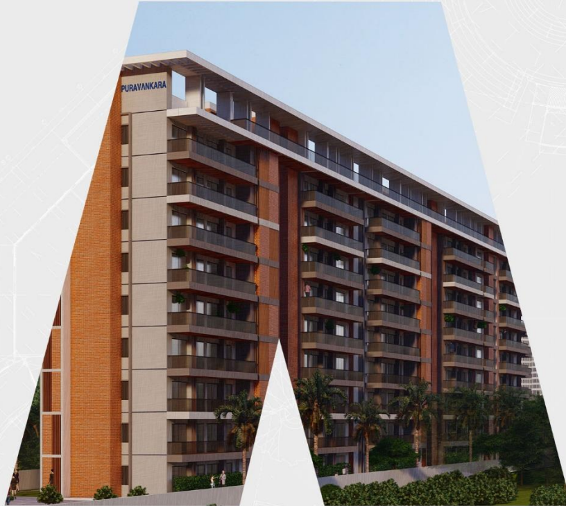
A PURAVANKARA HOME AT PURVA MERAKI