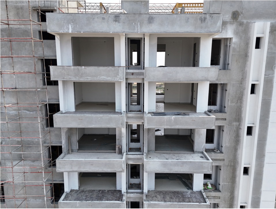
Tower A - 6 th Floor Tile in progress