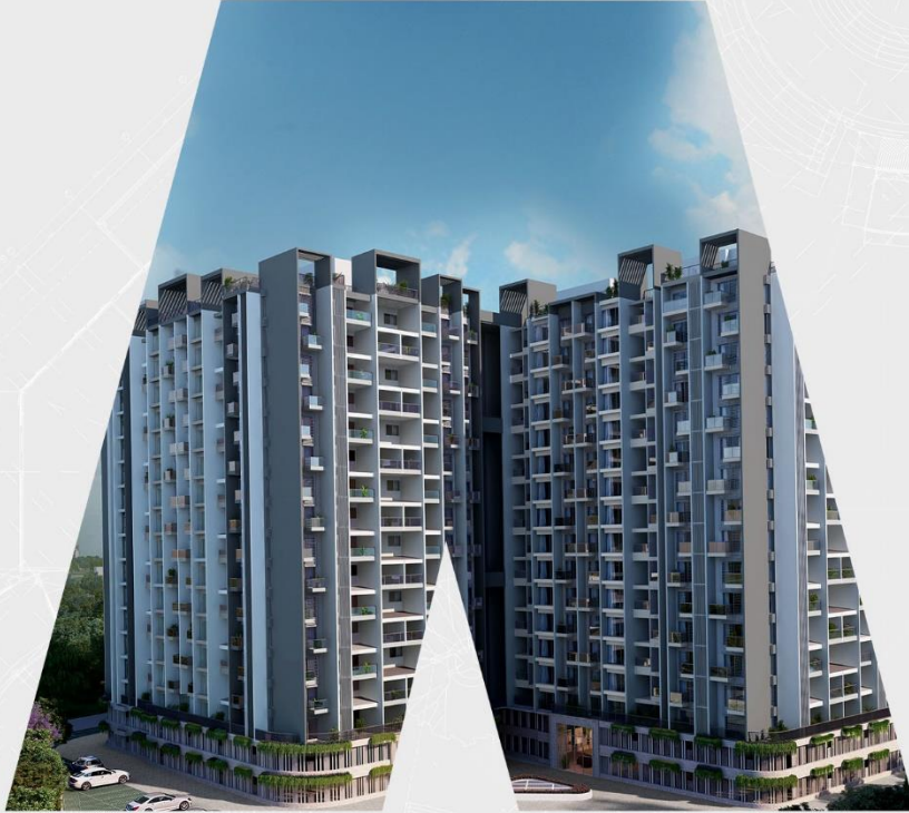
A PURAVANKARA HOME AT PURVA ASPIRE