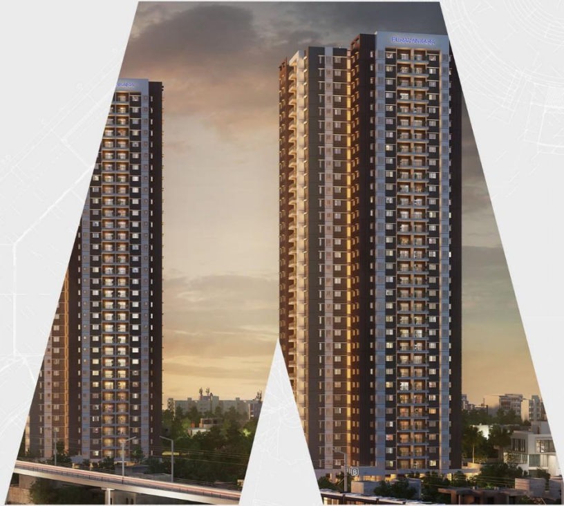
A PURAVANKARA HOME AT PURVA BLUBELLE