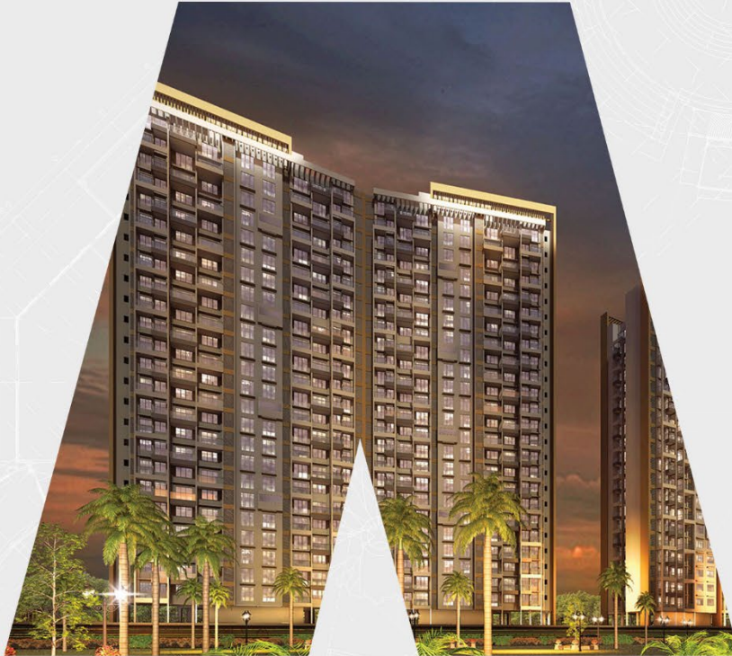
A PURAVANKARA HOME AT PURVA SILVERSANDS