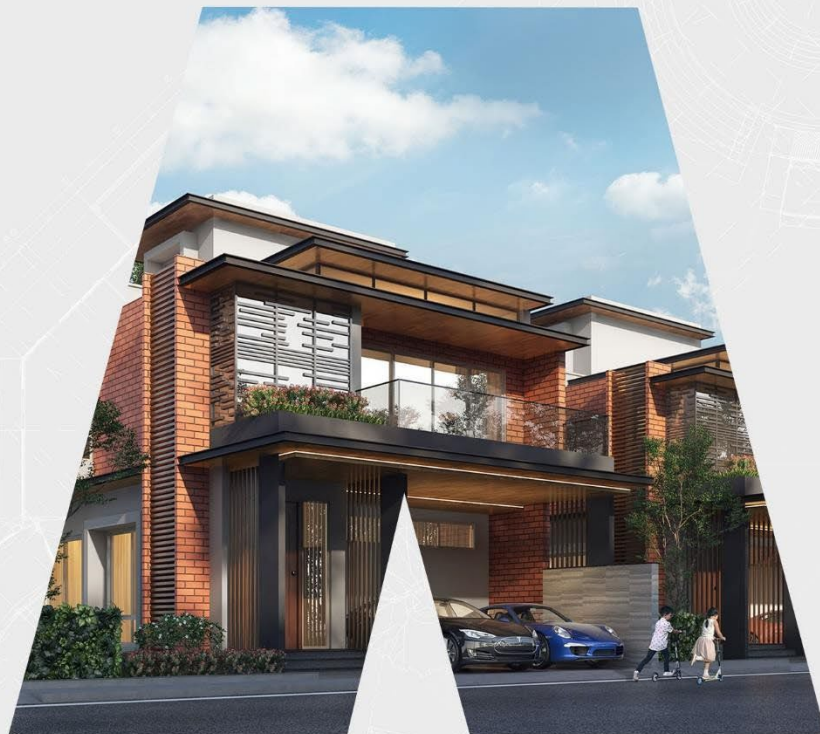
A PURAVANKARA HOME AT SPARKLING SPRINGS